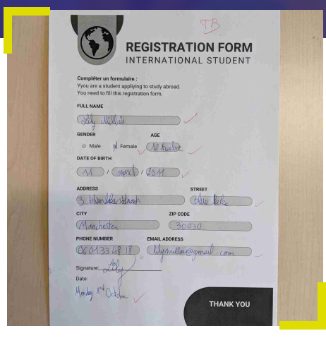
I can fill a form with my informations

En anglais je sais : - compléter un formulaire simple - utiliser le vocabulaire que je connais pour faire mon portrait - me présenter - parler de ma famille - décrire une personne - écrire un mail à quelqu'un